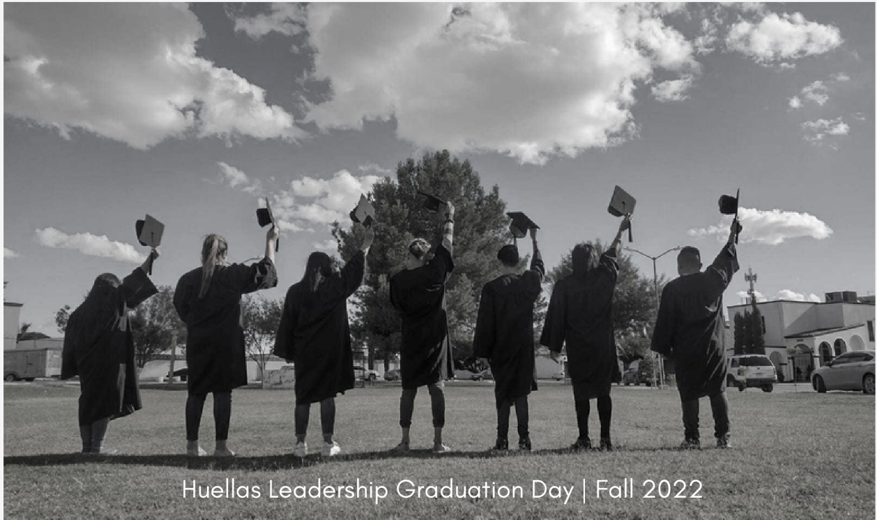
Huellas Leadership Graduation Day | Fall 2022